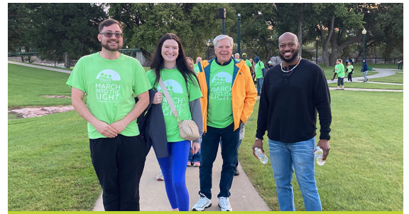
2024 March Into the Light